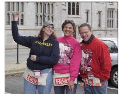
St. James Volunteers at the JCTC parking lot had fun in spite of the cold.

Be Sure to Read Future Issues for More "Take a Bow"!