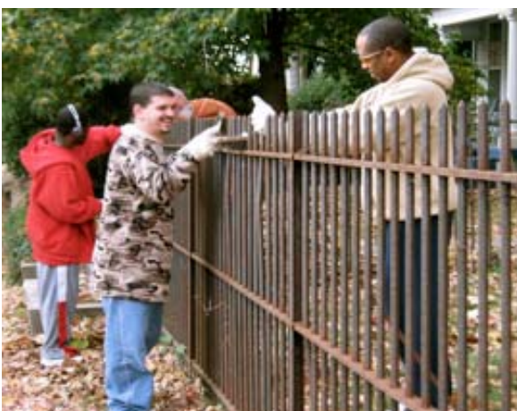
Dismas Charities’ clients.