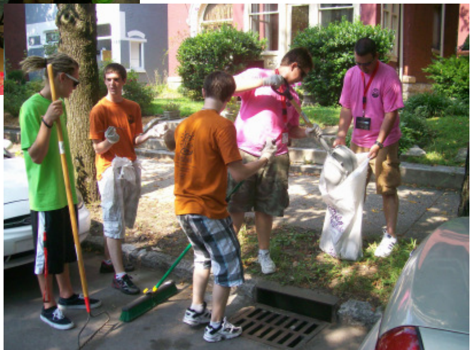
Cleaning debris rom catch basins