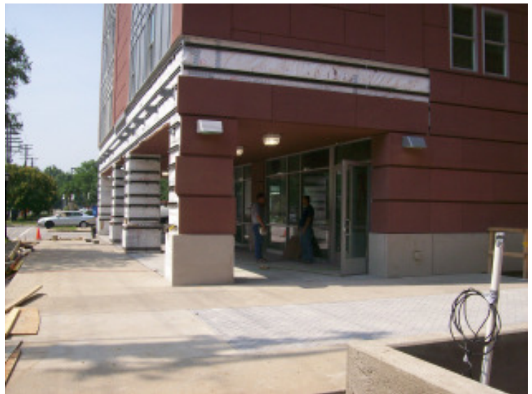
Cardinal Towne buisnesses in development.