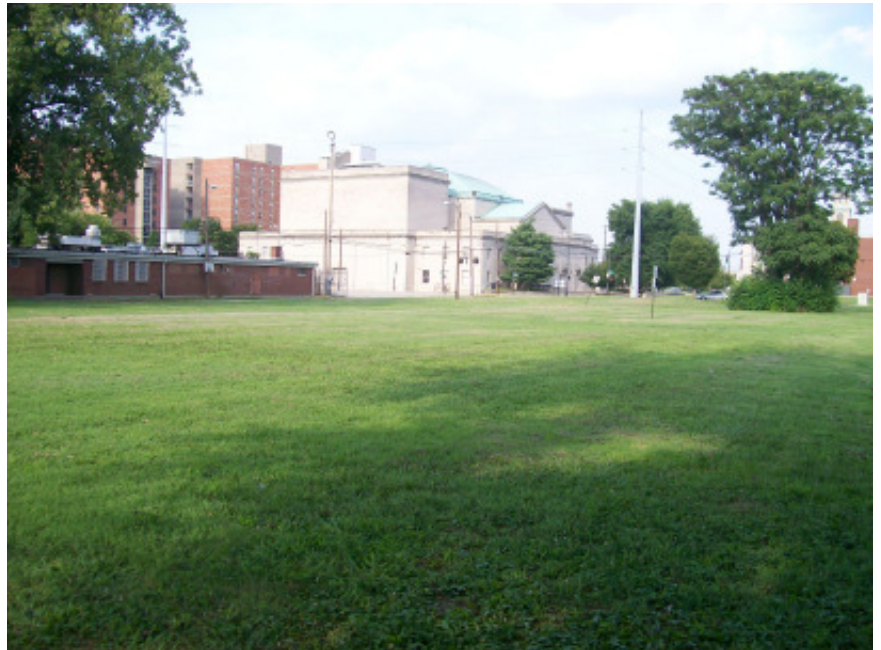
Site to be developed for Family & Children's Place expansion.

Dan Fox agreed to keep the Old Louisville neighborhood informed as plans develop.