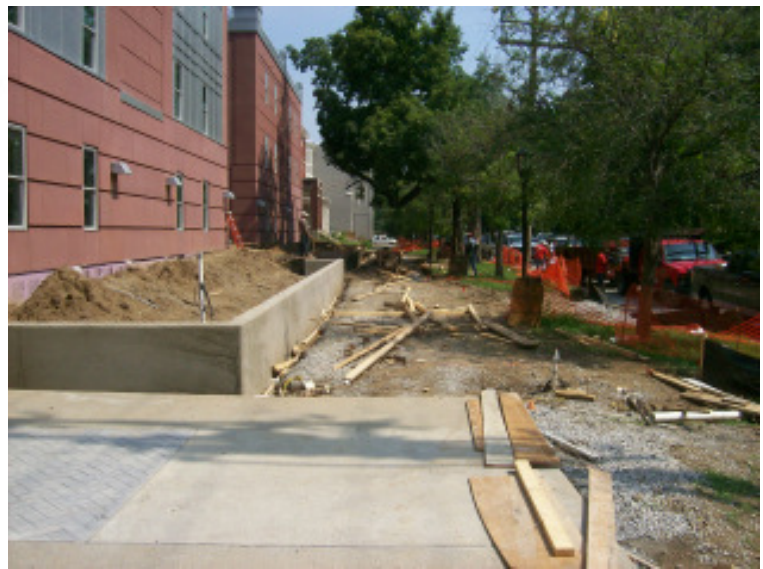
Third Street site improvements under construction at Cardinal Towne.