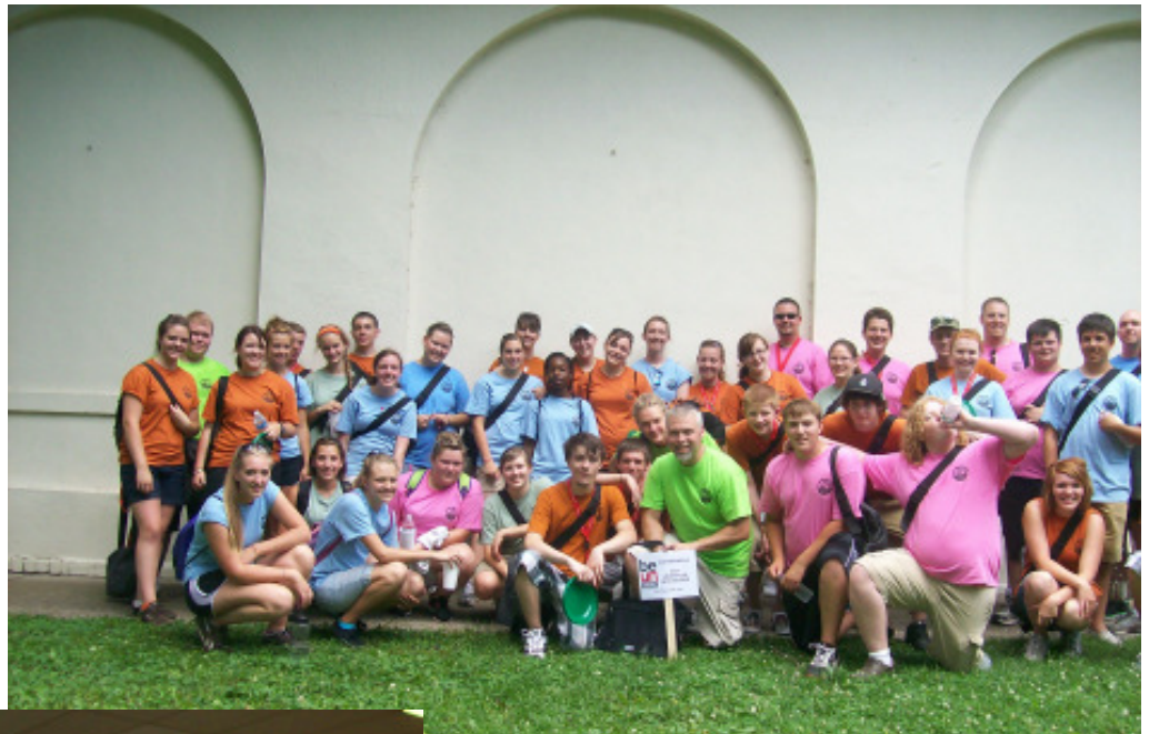
A happy group of Nazarene youth

their neighborhood volunteers to participate and provide guidance in regard to this undertaking.