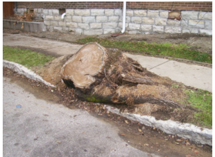
One of the many tree stumps to be removed.