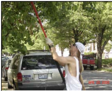
Trimming the trees

In preparation for St. James Court Art Show, the SSNA sponsors an annual fall cleanup. Trees are trimmed of low hanging and dead branches and a litter pick up is performed. Magnolia Park is weeded and spruced up to give visitors a favorable impression of the neighborhood. During the art show, the Association provides parking and shuttle service for visitors from the Jefferson Community and Technical College parking lot at 2 nd and Broadway. Many visitors, especially those from out of town who do not know the area, find this a convenient service. The location also provides easy access to all the major interstates. Volunteers had to dress extra warm this year when the weather turned cold and blustery on