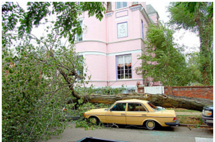
September 14, 2008, Cars on St. James Court.

Some other highlights of the first decade of the twenty first century: