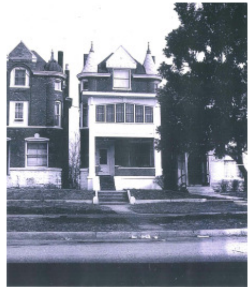
Photo of 1331 S. Brook St. taken circa 1973 and also showing the residence to the north which as demolished during the 1980's.

The approvals for demolition and improvements included conditions.