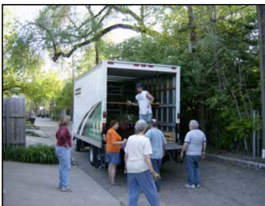
Volunteers unload thousands of plants from the nursery

In April, the SSNA held its 23 rd Annual Bedding Plant Sale. Plants are ordered from a local nursery and sold to Old Louisville residents to encourage beautification in the neighborhood. Second Streeters also planted flowers in urn planter vases we have placed along the street. Many Second Streeters also volunteered to help out at Herb's Central Park Clean Up & Improvement Activity in April.