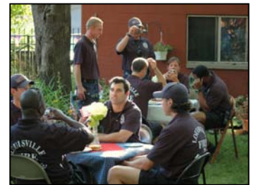
Police & Firefighters at the picnic