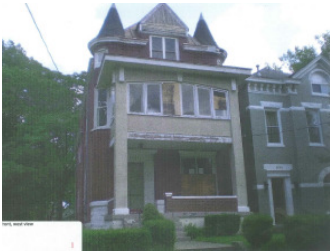
Today, before removal on 2nd floor room-porch.

Also, the frame two-story rear addition and three-story deck/fire escape will be demolished and replaced by a new two-story deck/screened-in porch, with trellis-fire escape stair tower.