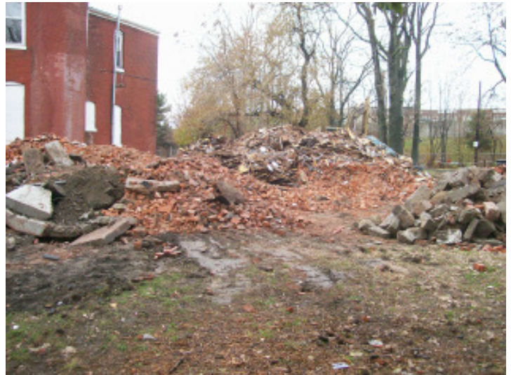
923 S. 1st St. demolished.