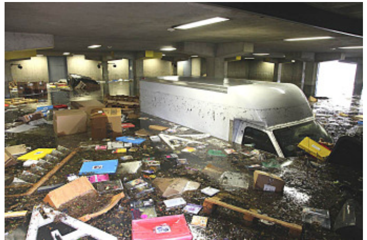
August 4, 2009, Library flooding.

August 4, 2009 - Flash flood. Cars floated in the streets. Historic flooding/damage basement flooding at downtown Louisville Free Public Library, U of L campus, and Churchill Downs.