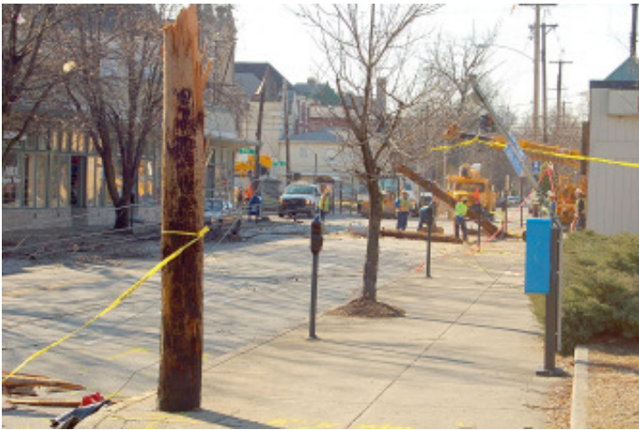
February 11, 2009, Power poles snapped in two along 4th St.