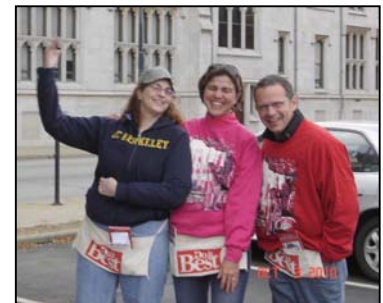
St. James Volunteers at the JCTC parking lot had fun in spite of the cold.

Be Sure to Read Future Issues for More "Take a Bow"!