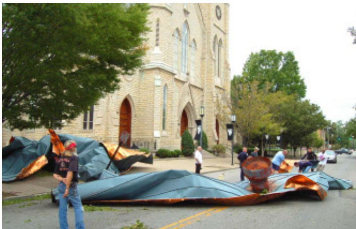
September 14, 2008, Steeple blown off of St. Louis Bertrand church.

October 18, 2007 - A small tornado touched down at the Kroger in Clifton, then passed right over WAVE3 TV while they were on the air with tornado coverage.