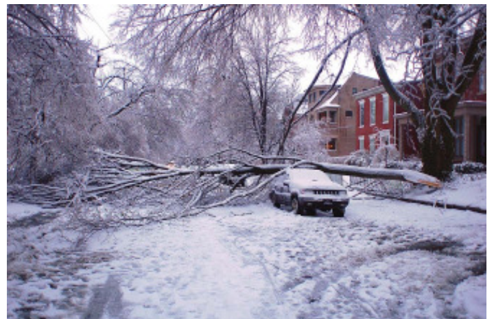
January 27-28, 2009, The Big Ice Storm on 2nd St.

February 11, 2009 - Severe Thunderstorms and high winds around 7pm. 78,000 without power. Old Louisville is hit hard, again.